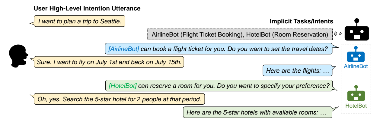
Figure 1: Illustration of a multi-task dialogue example.

generative model trained on \text{ATOMIC}_{20}^{20} (Hwang et al., 2021) to predict potential intents linking given user high-level utterances with corresponding task-oriented bots. The inferred intents can activate the relevant task-oriented bots and also serve as justification for recommendations, thereby enhancing explainability. This work is the first attempt to integrate external commonsense relations with task-oriented dialogue systems.