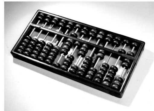
Figure 0.3 An Abacus