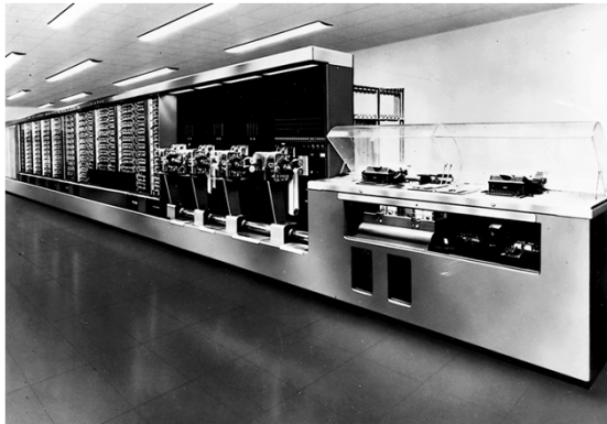
Figure 0.4 The Mark I computer