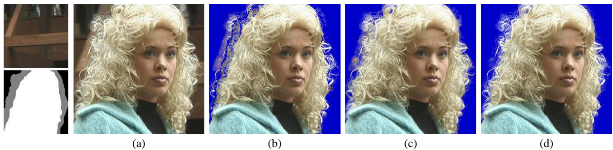
Figure 3 Background estimation in Bayesian matting. On the far left are the keyframe trimap and estimated background for a single frame. Using the original image (a) and the trimap without the background, Bayesian matting pulls a matte with errors, as shown in a composite over blue (b). Including the background but using instead the method of Ruzon and Tomasi gives an improved result (c), but flaws in the matte are still visible. Applying the Bayesian matting with background results in a higher-quality matte and composite (d).