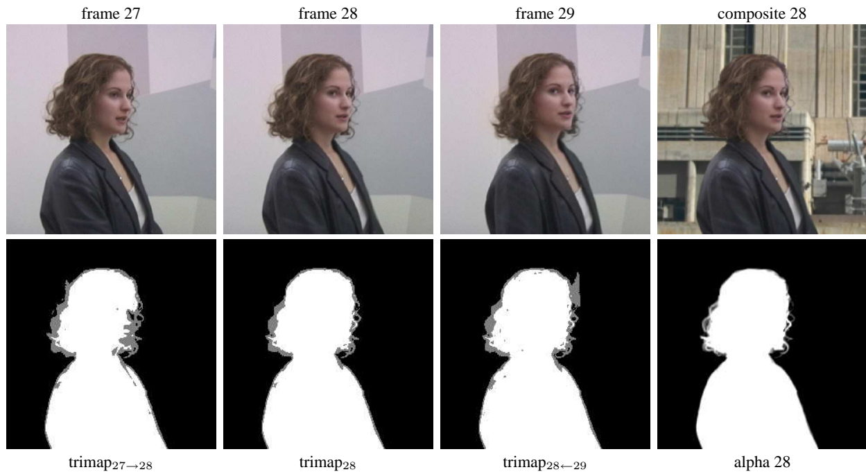
Figure 2 Combining bi-directional flow. For frames 27, 28, and 29 (shown above) and the current trimaps for frames 27 and 29 (neither shown), we estimate the trimap for frame 28. Flowing the trimap in the forward direction ( 27 \rightarrow 28 ) yields a trimap with extra uncertainty due to disocclusion as the actor's face turns to the right. The trimap predicted by flowing backward ( 28 \leftarrow 29 ) has less uncertainty in those regions, but suffers from disocclusions where the background is newly exposed. By combining the information in both these trimaps, we can compute trimap 28 automatically, which is better than either one alone. The right column shows a composite into a new scene (top) using the pulled matte (bottom) based on the combined trimap.