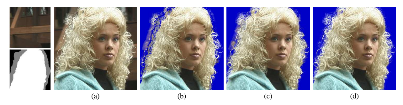
Figure 3 Background estimation in Bayesian matting. On the far left are the keyframe trimap and estimated background for a single frame. Using the original image (a) and the trimap without the background, Bayesian matting pulls a matte with errors, as shown in a composite over blue (b). Including the background but using instead the method of Ruzon and Tomasi gives an improved result (c), but flaws in the matte are still visible. Applying the Bayesian matting with background results in a higher-quality matte and composite (d).