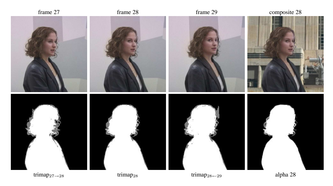
Figure 2 Combining bi-directional flow. For frames 27, 28, and 29 (shown above) and the current trimaps for frames 27 and 29 (neither shown), we estimate the trimap for frame 28. Flowing the trimap in the forward direction (27 \rightarrow 28) yields a trimap with extra uncertainty due to disocclusion as the actor's face turns to the right. The trimap predicted by flowing backward (28 \leftarrow 29) has less uncertainty in those regions, but suffers from disocclusions where the background is newly exposed. By combining the information in both these trimaps, we can compute trimap 28 automatically, which is better than either one alone. The right column shows a composite into a new scene (top) using the pulled matte (bottom) based on the combined trimap.