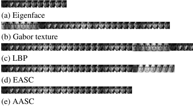
Figure 2. The visual clustering performance of different methods for CMU data set. AASC correctly grouped photos of a subject into a cluster while other methods either wrongly included photos of other subjects or left out some photos of the subject.

train-stemmed and r52-test-stemmed to evaluate AASC. Let D = \{d_1, \dots, d_n\} be the set of documents and T = \{t_1, \dots, t_m\} the set of distinct words occurring in D . We denote the frequency of word t \in T in the document d \in D as tf(d, t) . tf-idf is a weighting scheme which weights the frequency of a word t in the document d with a factor that discounts its importance with its occurrences in the whole document collection, which is defined as